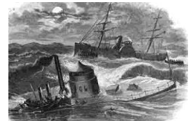
Photo Link: https://www.defense.gov/explore/story/Article/2046797/medal-of-honor-monday-navy-seaman-lewis-horton/source/GovDelivery/