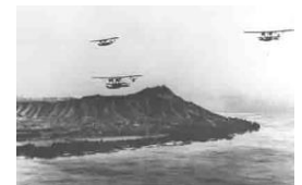
Photo Link: https://www.history.navy.mil/content/history/nhhc/our-collections/photography/numerical-list-of-images/nhhc-series/nh-series/NH-81000/NH-81663.html

On Jan. 10, 1934, a group of six P2Y-1 flying boats—Lt. Cmdr. Knefler McGinnis of VP-10F commanding—made a nonstop formation flight from San Francisco, CA, to FAB Pearl Harbor, Territory of Hawaii, into the next day, in 24 hours and 35 minutes. Their accomplishment bettered the best previous time for the crossing, exceeded the distance of previous mass flights, and broke a nine-day-old Class C seaplane world record for distance in a straight line with a new mark of 2,399 miles. For more on naval aviation milestones, go to NHHC's website .