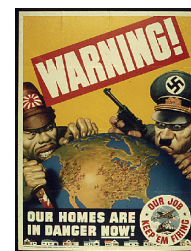
Photo Link: https://www.navytimes.com/news/your-navy/2019/12/30/four-days-in-december-germanys-path-to-war-with-the-us/

On Dec. 7, 1941, the Japanese attacked Pearl Harbor and, in the Philippines , simultaneously invaded the Pacific holdings of the Netherlands and England. Four days later, Japanese ally Nazi Germany declared war on the United States, and Italy soon followed. Although these moves appeared to be impulsive and just a display of Axis solidarity, the reality was quite different. Adolph Hitler had long recognized that to achieve world domination, war with the United States was a necessity. The attack on Pearl Harbor provided Hitler the opportunity to orchestrate an international conflict to suit the needs of the Third Reich. War with the United States had been on Hitler's wish list for more than two decades. On Dec. 8, 1941, Hitler ordered the Kriegsmarine to sink on sight any ship flying the U.S. flag. By Dec. 9, Nazi propagandist Joseph Goebbels concluded the United States could no longer aid England and the Soviet Union and, by Dec. 10, predicted the complete demise of the United States. For more, read the article in the Navy Times .